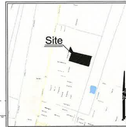
VICINITY MAP Scale: 1"=2,000'±