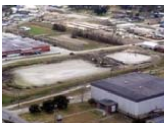
Left: Reservoir BEFORE