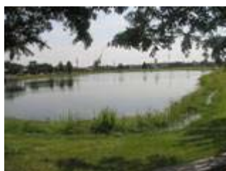
Right: Reservoir & Walking Trail AFTER