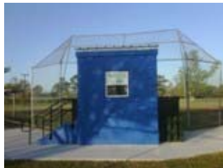
Completed Press Box on Minor's Field