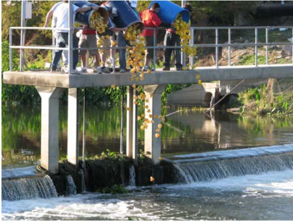
Photo 1: The brave, rubber duck participants (sort of) agree to be dumped at the weir into Bayou Lafourche.