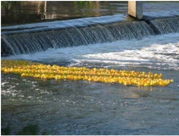
Photo 2: The quickest and strongest Duck Warriors begin to jockey for position.