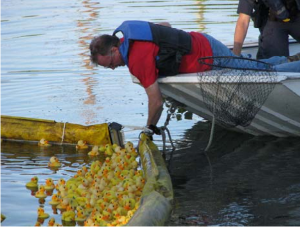
Photo 5: The other weary, disappointed ducks anxiously await their turn to be “scooped to safety” by Deputies.