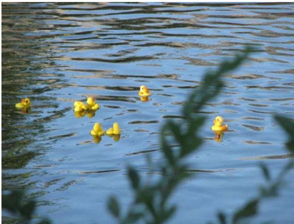
Photo 3: The not-so-turbulent waters of Bayou Lafourche quickly weed out the winners from the losers as the top contenders begin making their way to the finish line.