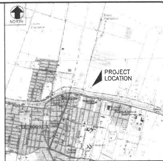
VICINITY MAP SCALE 1" = 2000'